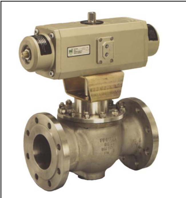
Fig. 1 - Series 23a Rotary Plug Valve