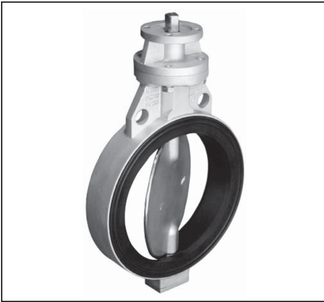
Fig 1 - Shut-off valve Series 17z