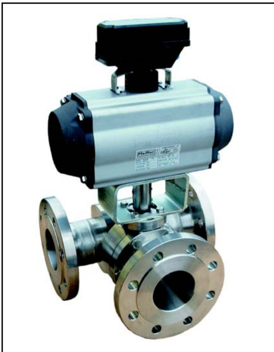
Fig 1 - Metering valve Series 28a with AT- Actuator Series 31a